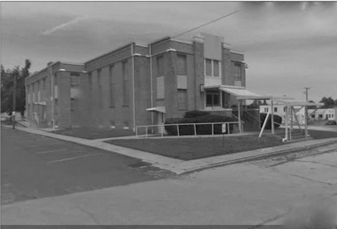
First Baptist Church 2007