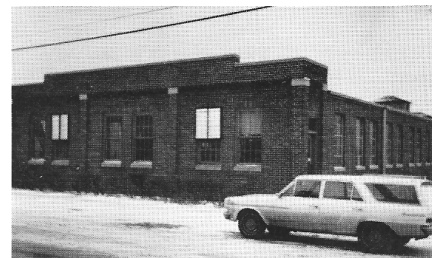
Tweedie Building Our church home from July 5, 1948 until April 2, 1950.