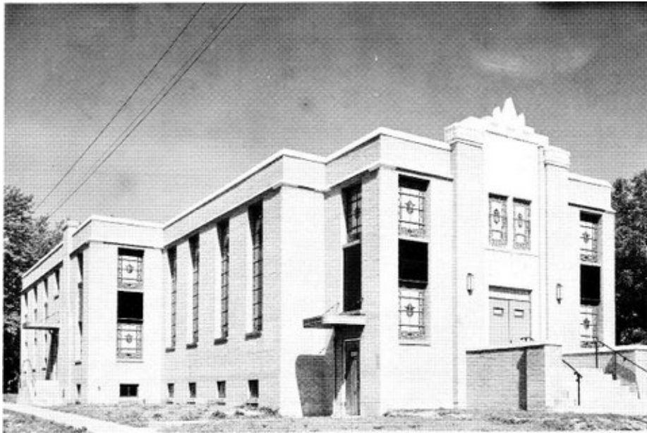
Our present church building built 1948 - 1950. Dedication held April 2, 1950.