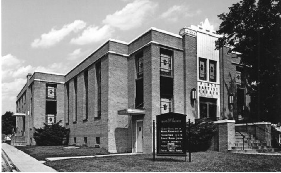
This was the church in about 1970 before the addition of the canopy out front.