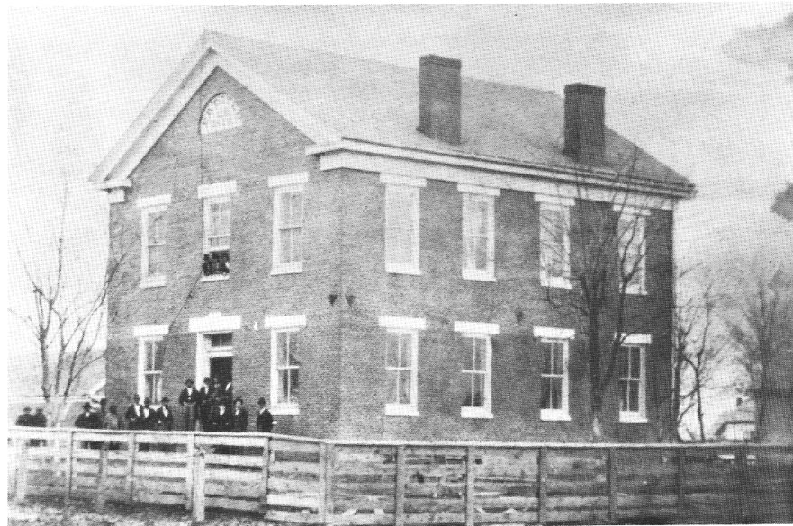
Morgan County Court House - Versailles, Missouri, built in 1844 and destroyed by fire at the time of the big Versailles fire, March 13, 1887. Our church met here from May 16, 1869 until July 19, 1879.