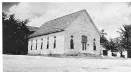
Our first church building, built during 1877 to 1879. First meeting held in this building July 19, 1879. Dedicated in 1881 with Rev. Manley J. Breaker preaching the Dedication sermon. Our last meeting in this building June 27, 1948.