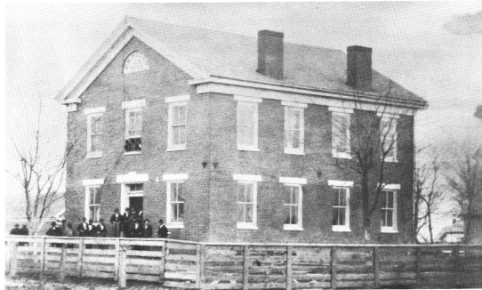
Morgan County Court House - Versailles, Missouri, built in 1844 and destroyed by fire at the time of the big Versailles fire, March 13, 1887. Our church met here from May 16, 1869 until July 19, 1879.