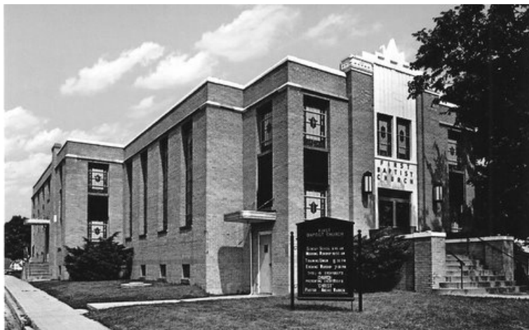
Original Church Covenant

As we trust we have been brought by divine grace to embrace the Lord Jesus Christ, and by the influence of his spirit to give ourselves up to him, so we do now solemnly covenant with each other that God enabling us we will walk together in brotherly love; that we will exercise a Christian care and watchfulness over each other and faithfully warn, rebuke and admonish one another as the case shall require; that we will not forsake the assembling of ourselves together, nor omit the great duty of prayer, both for ourselves and for others; that we will participate in each other's joys, and endeavor with tenderness and sympathy, to bear each other's burdens and sorrows; that we will earnestly endeavor to bring up such as may be under our care in the nurture and admonition of the Lord; that we will seek divine aid to enable us to walk circumspectly and watchfully in the world; denying ungodliness and we will endeavor, by example and effort, to win souls to Christ; and through life amidst evil report and good report seek to live to the Glory of Him who hath called us out of Darkness into His Light.