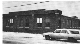
Tweedie Building Our church home from July 5, 1948 until April 2, 1950.